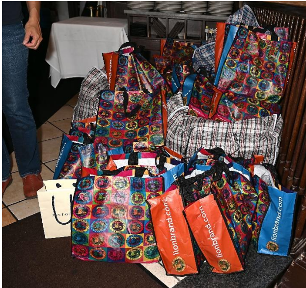
A multitude of goody bags (above), and some happy recipients (below).

As we all know, it wouldn't be a BAKG luncheon without goody bags! Each of the 115 attendees received a large Lion Brand tote bag filled with knitting treats of all kinds: yarn, notions, discount coupons, pamphlets or maybe even a book, all courtesy of the large group of generous vendors listed below. The contents of each goody bag are always a little different, so each one is a surprise. Goody-bag gifts often introduce us to new yarns or new designers, or to a really useful new tool that we didn't know existed. Please thank the gift donors by patronizing their businesses when you shop, and let them know, if possible, that you're grateful for their support of the Big Apple Knitters Guild.